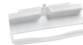
ADAPTOR PLATE FOR RECYCLED PAPER TOWELS