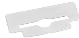
ADAPTOR PLATE FOR NARROW PAPER TOWELS