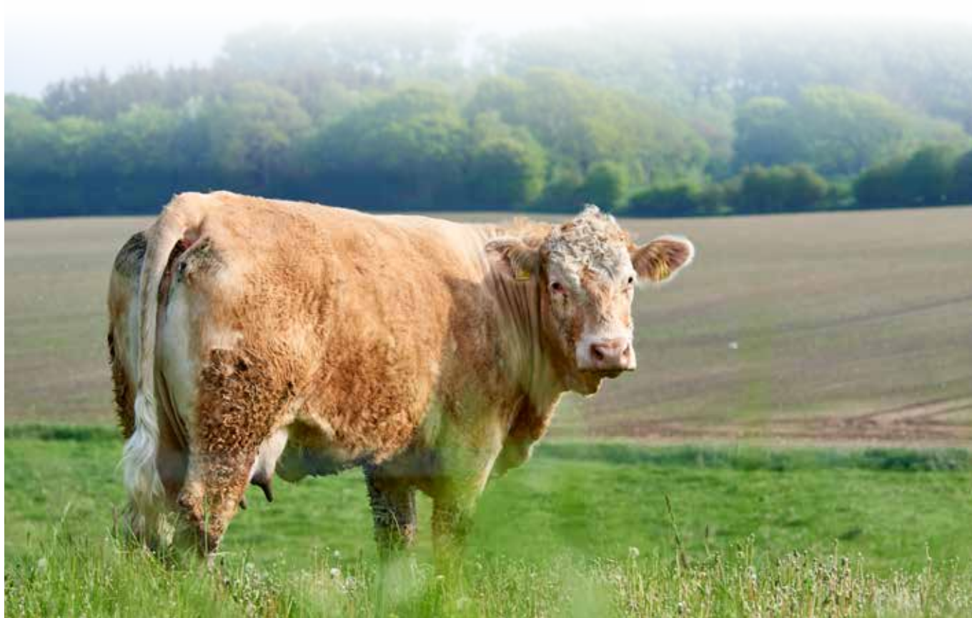
Cat. No 142035