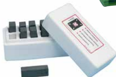
Cat. No 142037