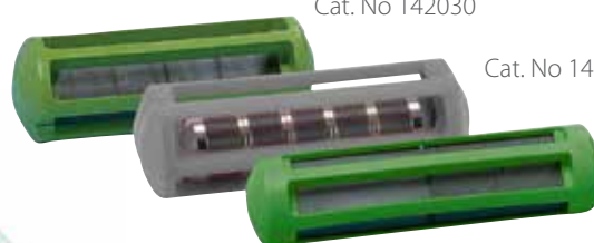
Cat. No 142030